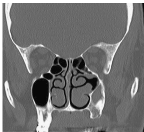
Figure 2 The left maxillary sinus is smaller and opacified. The middle meatus space is wide and the medial wall of the sinus is lateralized with contact with the lateral wall of the maxillary sinus.

Chronic rhinosinusitis (CRS) has a prevalence of 13.4% in adults older than 18 years of age, according to a national health survey conducted in 2008 [20]. The causes