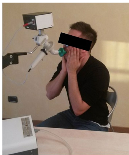
Fig. 1 Explanatory figure of a patient tested by impulse oscillometry

The clinical interpretation of the measurements is usually based on the two components of respiratory impedance Z_{rs} , respiratory resistance R_{rs} and lung reactance X_{rs} . Both R_{rs} and X_{rs} , which reflect total pulmonary impedance, are measured by the investigator in real time as a function of flow volume and pressure. Respiratory resistances at 5 and 20 Hz ( R_5 and R_{20} , in \text{kPa} \times \text{s} \times \text{L}^{-1} ) are used as indices of total and proximal airway resistance, respectively. Thus, the contribution of the distal airways are determined by the fall in resistance from 5 to 20 Hz ( R_5 - R_{20} , in \text{kPa} \times \text{s} \times \text{L}^{-1} ), that is considered to be an index for the resistance of peripheral airways, as already performed in asthmatic patients in clinical trials and hospital cohorts, and an R_5 - R_{20} cutoff of >0.07 \text{ kPa} \times \text{s} \times \text{L}^{-1} (a conservative upper limit of normal for R_5 - R_{20} as previously reported) is