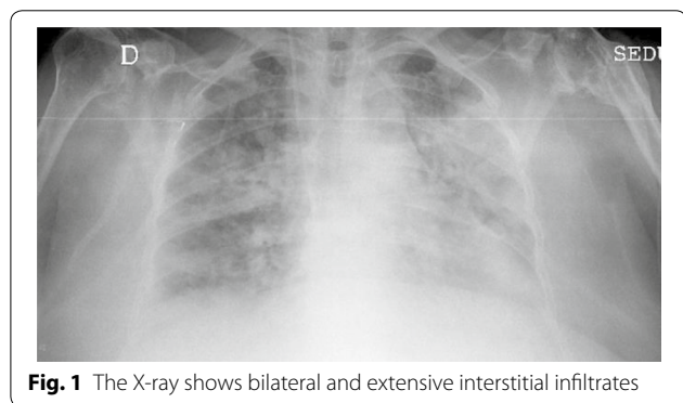
Fig. 1 The X-ray shows bilateral and extensive interstitial infiltrates

A multidrug regimen with hydroxychloroquine 200 mg twice a day, sodium enoxaparin and dexamethasone were started. Besides, an antibiotic treatment with ceftriaxone for 1 day, followed by piperacillin/tazobactam for 4 days was given. The patient was initially treated in a sub-intensive care unit and after the favorable clinical evolution