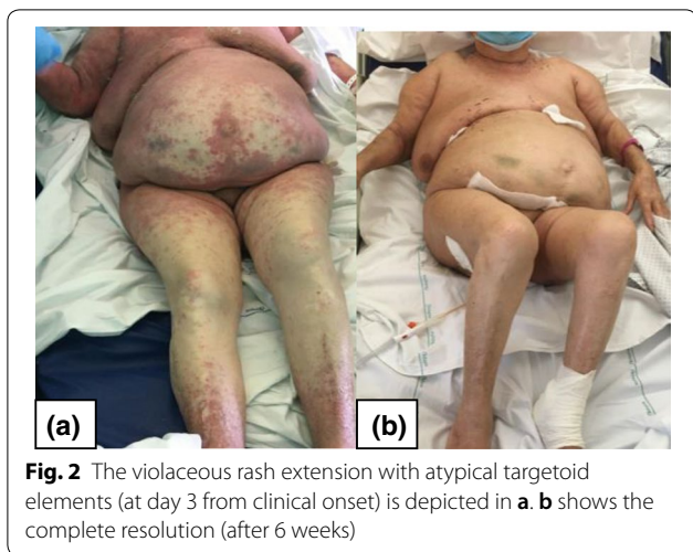
Fig. 2 The violaceous rash extension with atypical targetoid elements (at day 3 from clinical onset) is depicted in a . b shows the complete resolution (after 6 weeks)