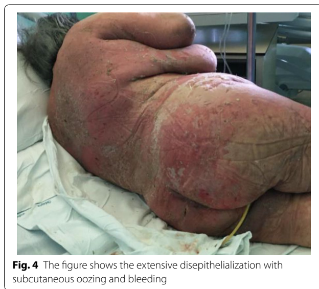
Fig. 4 The figure shows the extensive disepithelialization with subcutaneous oozing and bleeding

and levofloxacin. All suspected drugs according to the